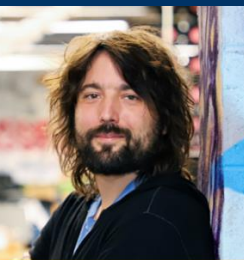
Tom Szaky Terracycle + LOOP