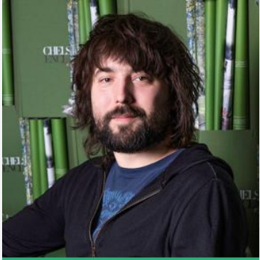
Tom Szaky Terracycle

Clean Break: Saying Goodbye To Single-use Plastic